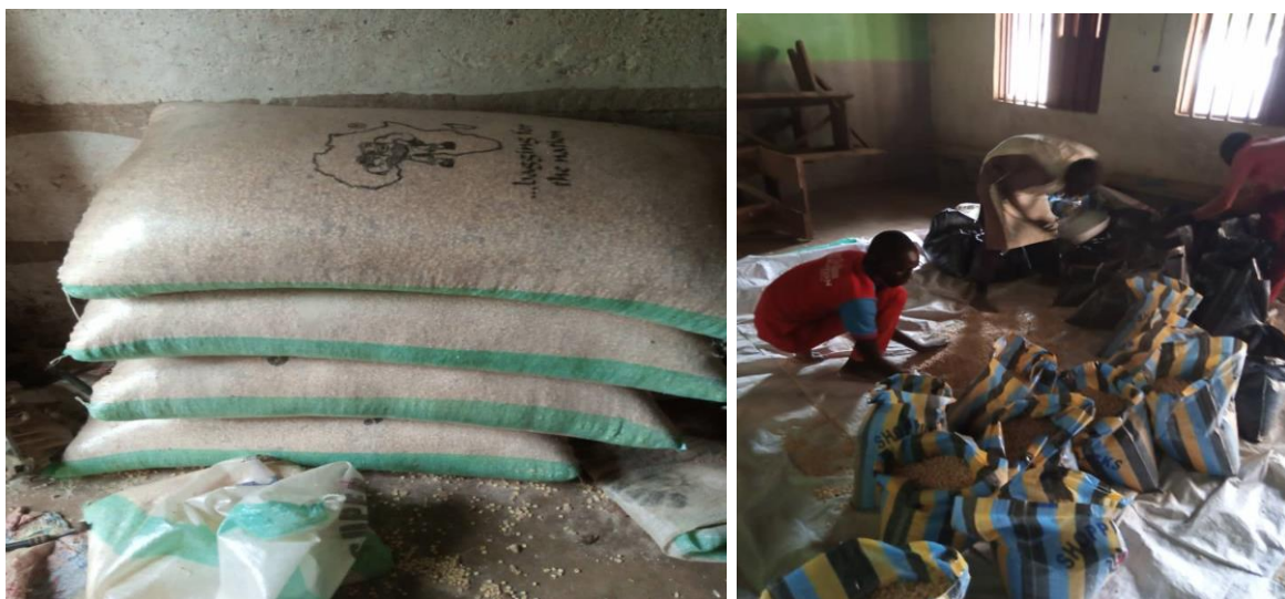
Food Relief to widows in Biu During Corona Lockdown and Boko Haram Victims on 5/1/2021 in Askira/Uba, assisted by COFP