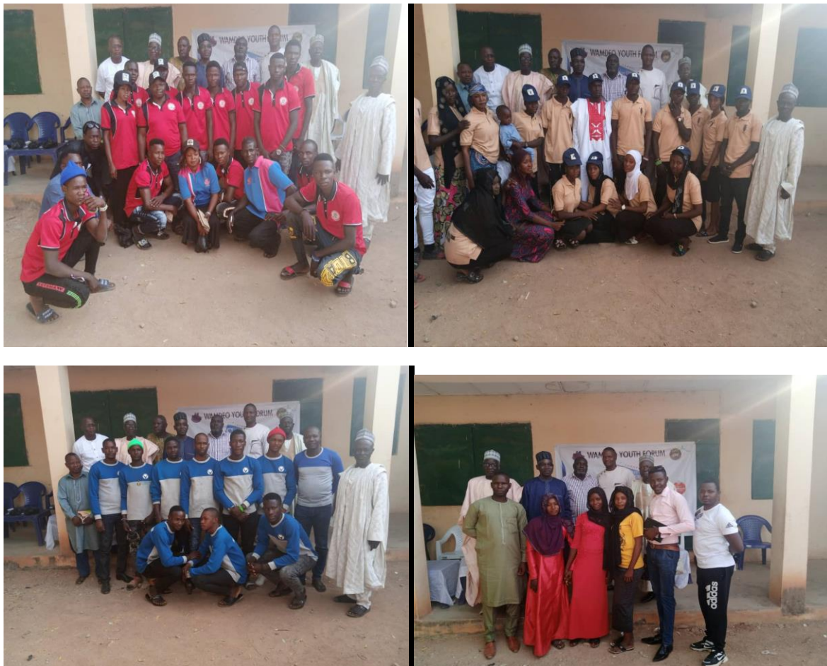
Peace seminar to five hundred (500) youths of Wamdeo in Askira/Uba LGA, Borno State on 1 st January, 2021- self sponsored