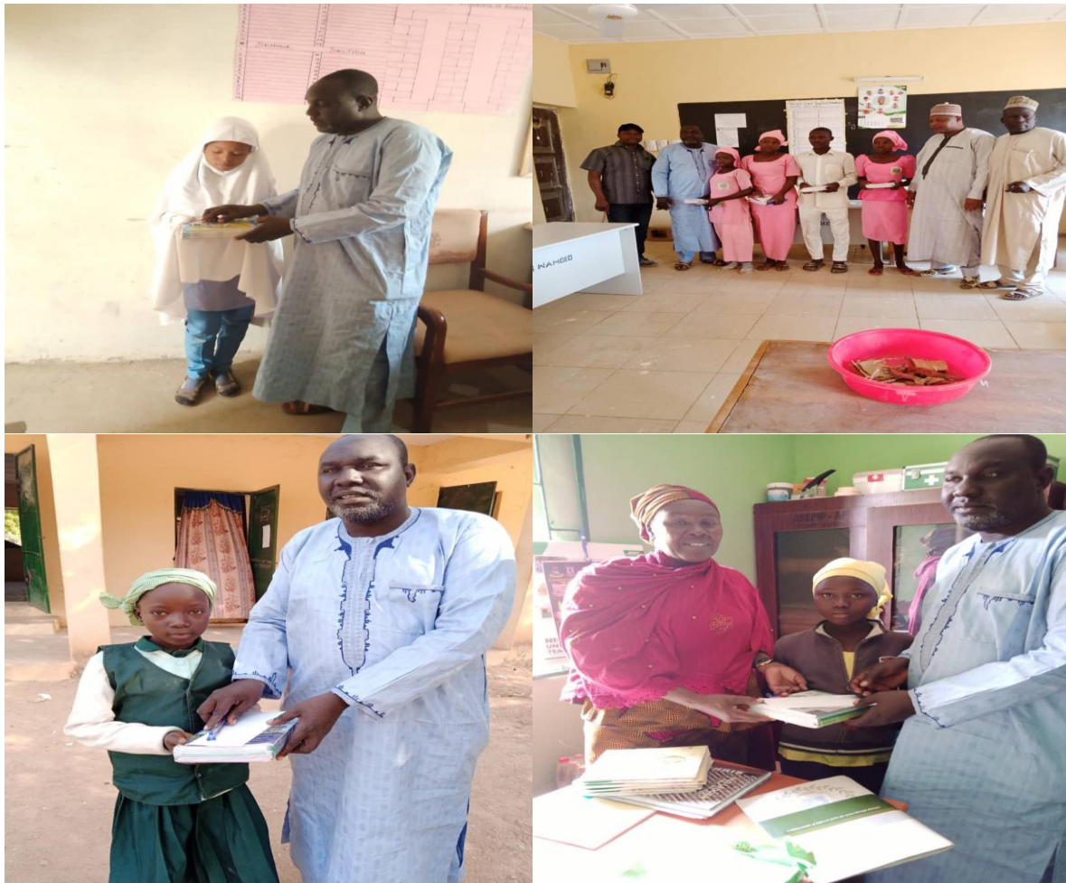
Award of scholarship to orphans victims of Boko Haram Insurgency by I-VEED in Borno and Adamawa State, 2020/2021 session (3 tremes fess, WAEC, NECO, books and uniforms for 61 students)