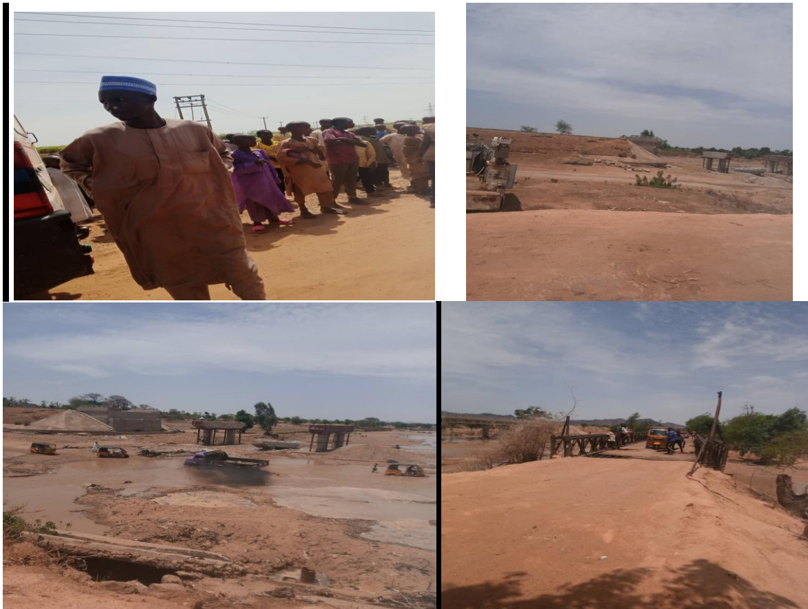
Need assessment in North East- Damages of roads by Boko Haram (Yola to Maiduguri)