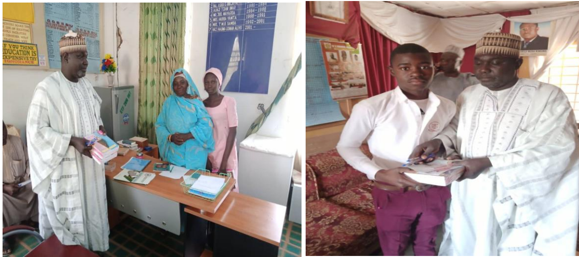
Award of scholarship to orphans of victims of Boko Haram insurgency by I-VEED in Borno and Adamawa State, 2019/2020 session (3 treme fess, WAEC, NECO, books and uniforms for 41 students)