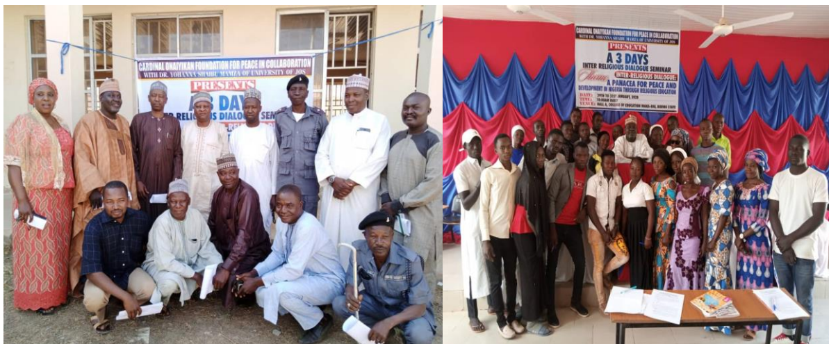
Cross section staff and students at College of Education Waka-Biu during three (3) days Peace Seminar.