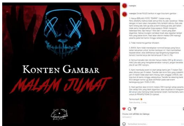
Figure 2: Post “Friday Night Image Content”

From the posts they made, it became a creative and unique outlet for the account owner to get the nickname "Indigo" and many Instagram users were also curious about the situation around them, until finally Rvan usually opened only on Thursday evenings. The content created can also attract users' attention and create two-way communication, to the point that Rvan X Jro often does live streaming via their Instagram. The type of content created is images of locations that contain illustrations of supernatural creatures in them. With this mystical content, the aim is that the public will no longer be afraid of supernatural creatures that exist around human life, because we actually live side by side with these creatures. For this reason, the content created by Rvan.